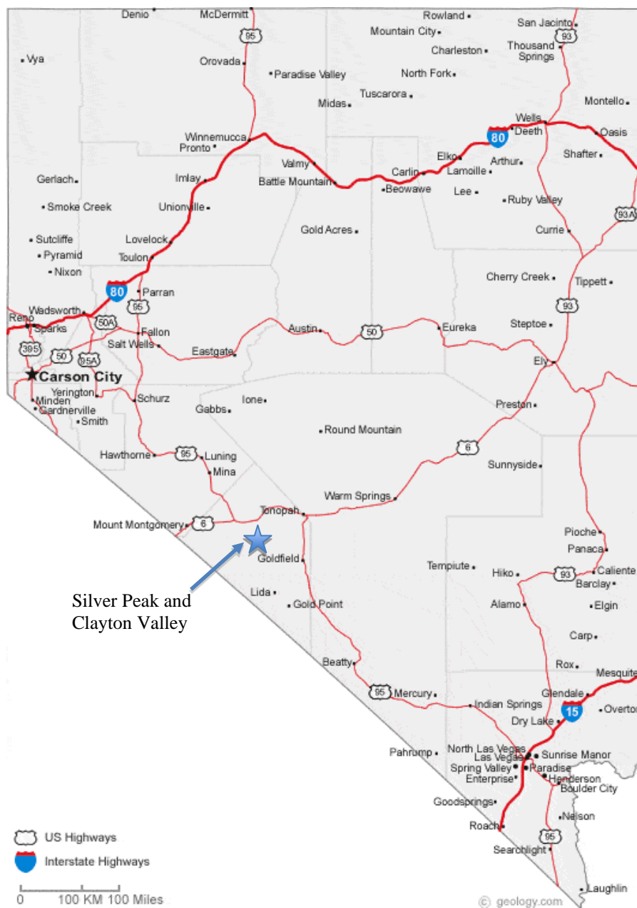
Figure 1: Clayton Valley Project Location Map